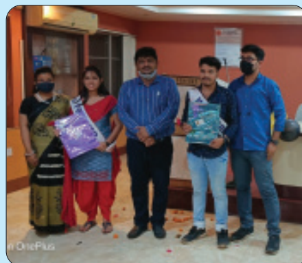
Welcome Ceremony for students of Synergy Institute of Science & Management, Dhenkanal