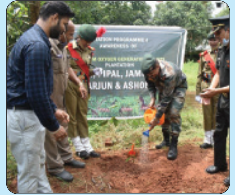
Plantation programme at Synergy, Dhenkanal,