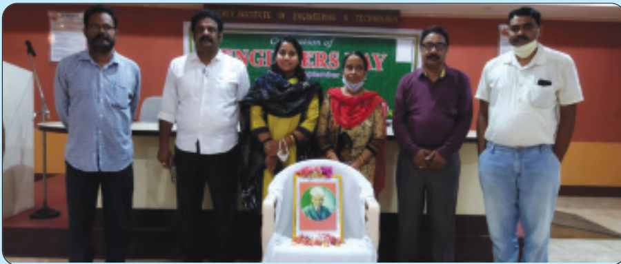
Engineers Day Celebration at Synergy, Dhenkanal