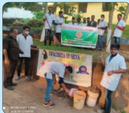
Swachhata Pakhwada at Synergy, Dhenkanal