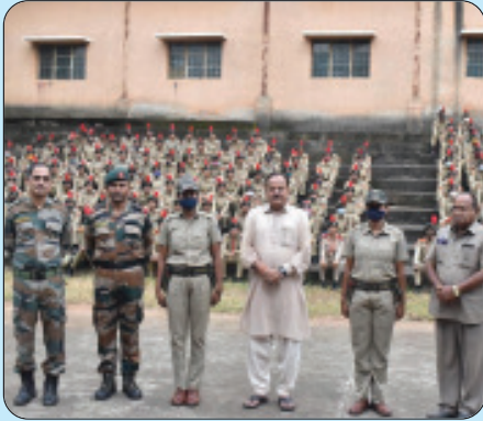
N.C.C Camp at Synergy, Dhenkanal