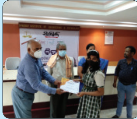
1 st anniversary celebration of Odia Daily "Sakala" at Synergy, Dhenkanal