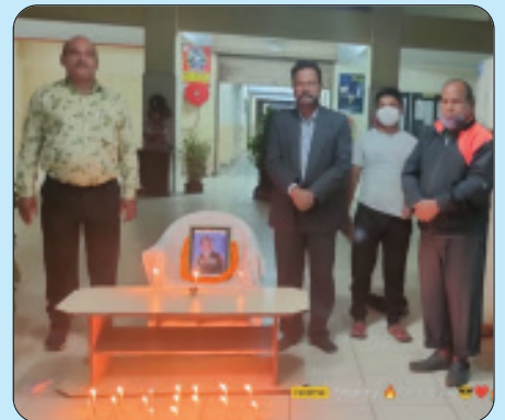
Condolence Ceremony for Late Bipin Rawat, 1 st CDS of Indian Armed Forces at Synergy, Dhenkanal