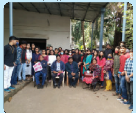
Study Tour by students of Synergy Institute of Science & Management, Dhenkanal